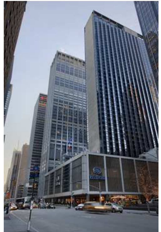
Hilton New York Hotel In the heart of Midtown Manhattan

In New York City you do not ever have to worry about waiting long for a taxi cab. Every second or third vehicle in Manhattan is a taxi and they are lined up outside the arrivals at LaGuardia. But – you will have to be patient getting from A to B. Traffic is always gnarled – so we settled in and enjoyed the sights on our drive from the airport to our hotel – The Hilton New York, Midtown , at 1335 Avenue of the Americas.