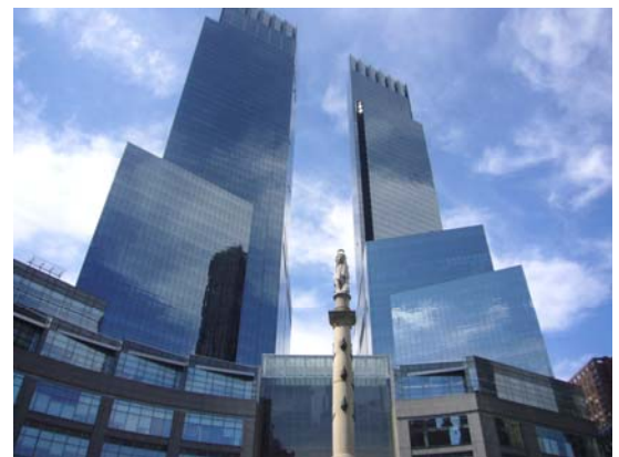
Time Warner Bldg. Columbus Circle

If this is your first visit to New York, a Gray Line 'Hop-on Hop-off' Bus Tour is an excellent introduction to the city and the best way to see as much of it as you can. There are a number of stops enroute throughout the city where you can purchase tickets and enjoy the convenience of being able to hop-off where ever you please and spend some time sightseeing, then hop-on the next available bus coming along the route. See it all onboard their deluxe open top double-decker buses, reminiscent of London in the UK. Your tour guide will offer commentary and interesting facts along each route. Another option is a full day guided luxury motorcoach tour of the city or a shopping excursion. There are multiple choices to suit your preferences.